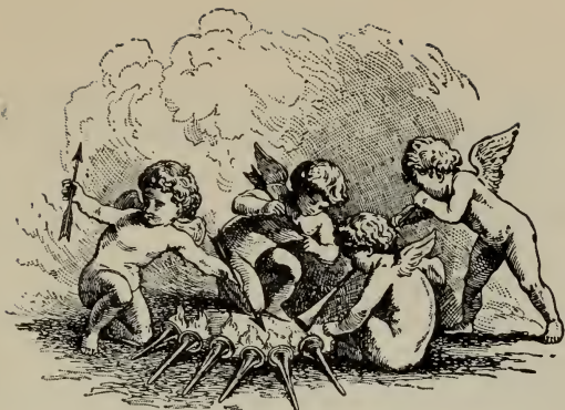
CUPIDS FORGING ARROWS